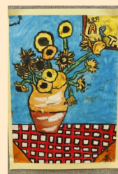
MWPS Art Show