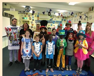
Book Week: Alice in Wonderland

It is the mission of Melton West PS to work collaboratively to ensure high levels of learning for all.