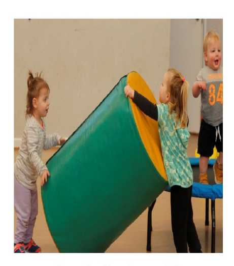
For any inquiries, please contact:

A FREE experience with morning tea provided.