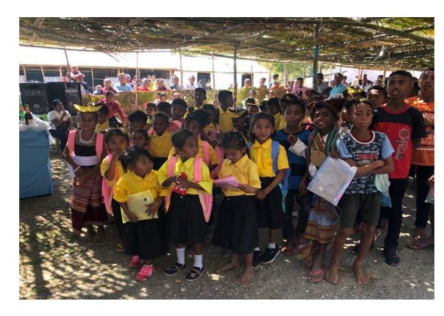
It is the mission of Melton West PS to work collaboratively to ensure high levels of learning for all.